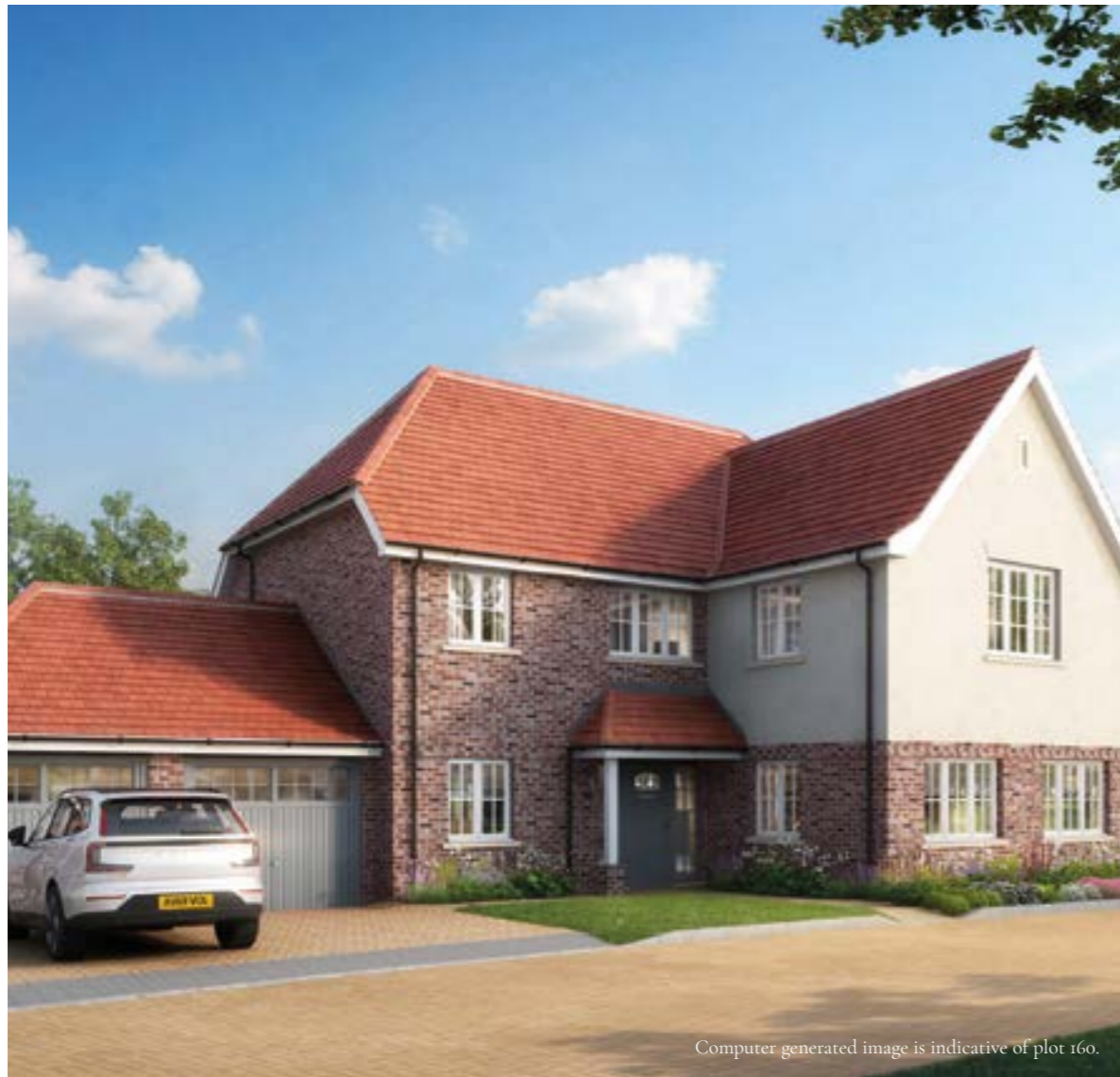
Computer generated image is indicative of plot 160.